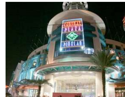
CENTRAL PLAZA PINKLAO (The Renovation) - M.E.P -

M = Mechanical E = Electrical P = Plumbing