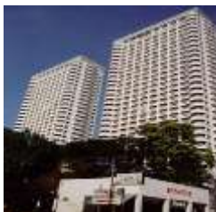
JOMTIEN COMPLEX - E -