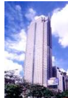
JEWELRY TRADE CENTER - M,E,P -