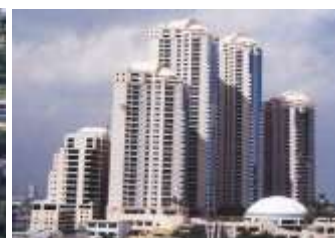
THE PRESIDENT PARK - M,E -

M = Mechanical E = Electrical P = Plumbing