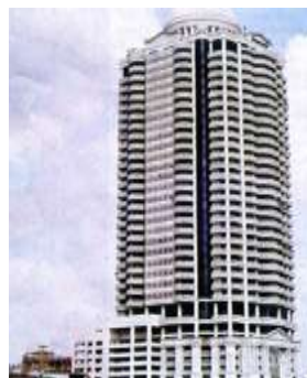
BANGKOK RIVER PARK - M,E,P -