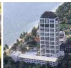
COCONUT BEACH CONDOMINIUM - M,E,P -