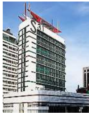
S31 HOTEL - M,E,P -