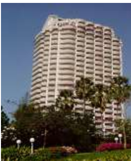
SILVER BEACH CONDOMINIUM - E -