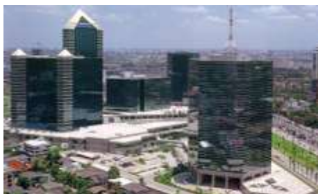
SIAM COMMERCIAL COMPLEX (PHASE III) - M.E.P. -