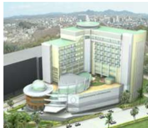
SONGKLANAKARIN HOSPITAL -M,E,P-