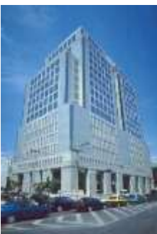
SRIJULSUP TOWER - M,E -