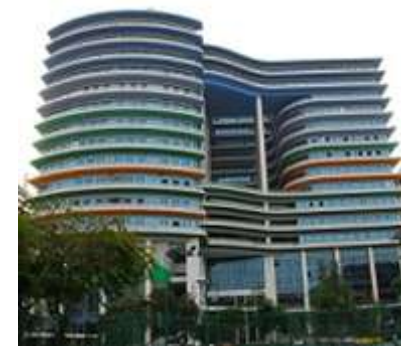
SIRIRAJ HOSPITAL Laboratory and IT studies for medical student -M,E,P-