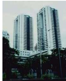
SATHORN GARDEN - M -