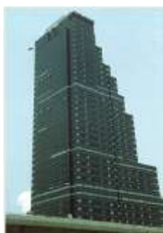
GEMS TOWER - M,E,P -

M = Mechanical E = Electrical P = Plumbing