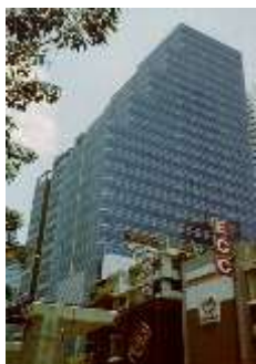
S.S.P TOWER III - M,E,P -