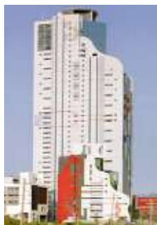
THE NATION TOWER I, II - M -