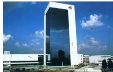
THAI AIRWAY INTERNATIONAL (Head Office) - M.E. -