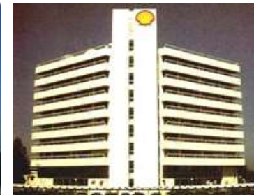
SHELL HEAD OFFICE - M -