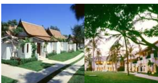
SALA-SAMUI RESORTS - M,E,P -