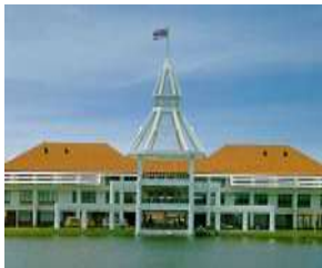
THAMMASAT UNIVERSITY (Rangsit Campus)