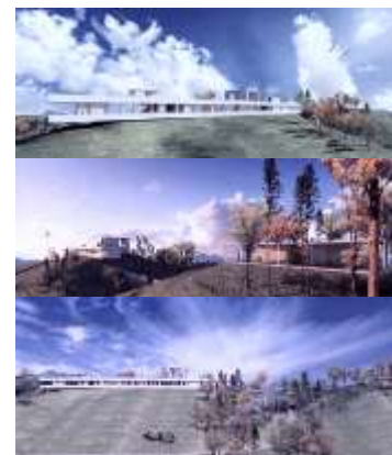
KHAO-YAI RESIDENCE -M,E,P-

M = Mechanical E = Electrical P = Plumbing