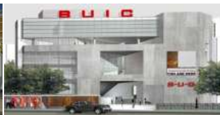
BANGKOK UNIVERSITY ART GALLERY - M.E.P -

STATE RAILWAY OF THAILAND The Master Plan for Land Use