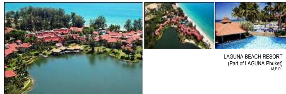
LAGUNA BEACH RESORT (Part of LAGUNA Phuket) - M.E.P. -