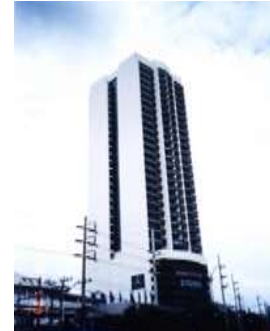
LUMPINI PARK VIEW - M,E,P -