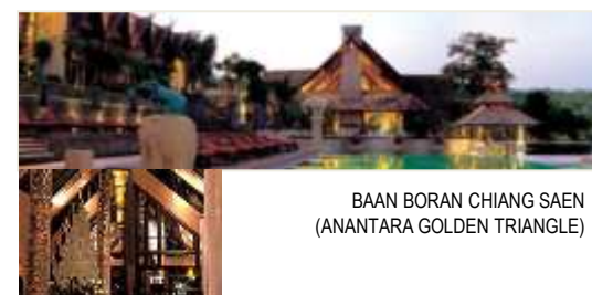
BAAN BORAN CHIANG SAEN (ANANTARA GOLDEN TRIANGLE)

M = Mechanical E = Electrical P = Plumbing