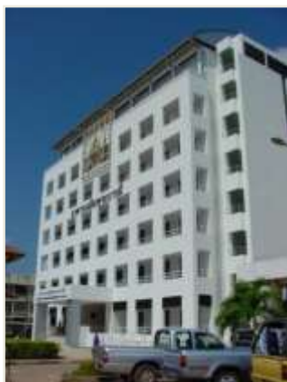
KALASIN HOSPITAL -M,E,P-