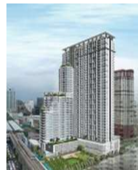
VILLA RACHATEWI - M,E,P -