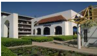
THAMMASAT UNIVERSITY LIBRARY - M -