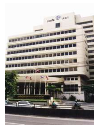
IFCT BUILDING - M.E. -

M = Mechanical E = Electrical P = Plumbing