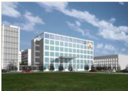
KHONKAEN HOSPITAL -M,E,P-