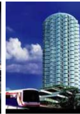
MERCURE AMBASSADOR HOTEL (Renovation) - M,E,P -