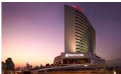
WESTIN GRANDE SUKHUMVIT - M. -