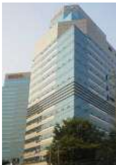
MALEENOND TOWER (Channel 3 TV Studio) - M,E,P -