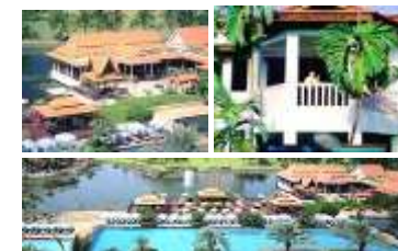
DUSIT AND RESORT HOTEL - M,E,P -