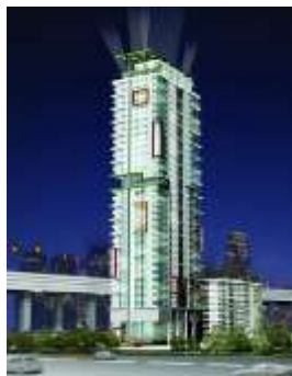
INTRO BY RASA Condominium - M,E,P -