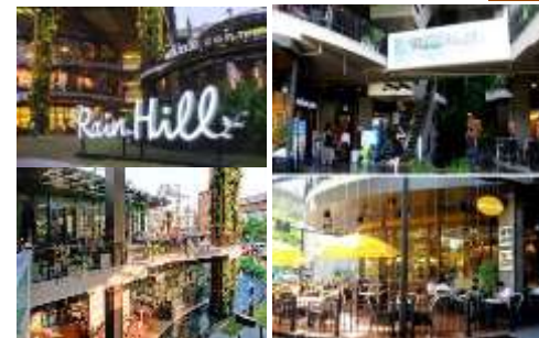
RAIN HILL - M.E.P -