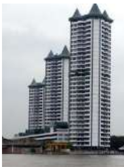
TRIDHOS CITY MARINA - M,E,P -