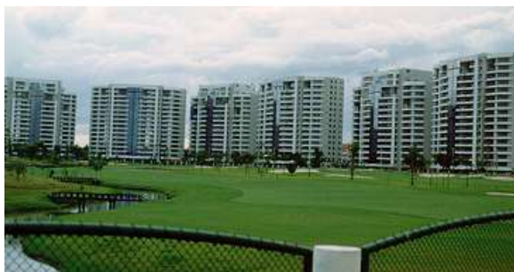
PARKLAND PHASE II - M,E,P -