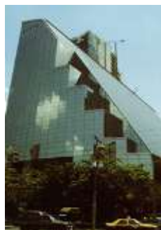
SIRIPINYO BUILDING - M,E -