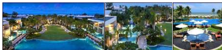
SHERATON GRANDE LAGOON HUA HIN - M.E.P. -