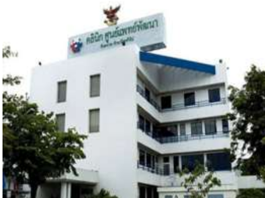
PATANA MEDICAL CENTER -M,E,P-