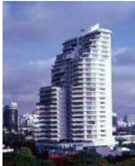
LA CASCADE - E -