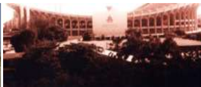
HUAMARK STADIUM - E -

M = Mechanical E = Electrical P = Plumbing