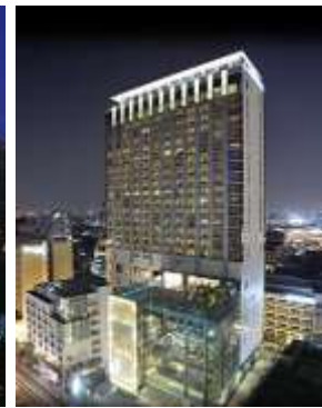
LE MERIDIEN BANGKOK - M,E,P -