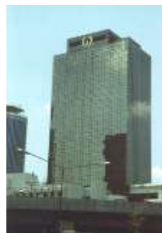
WALL STREET TOWER - M,E -