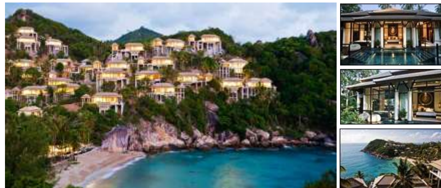
BANYAN TREE, SAMUI - M.E.P. -