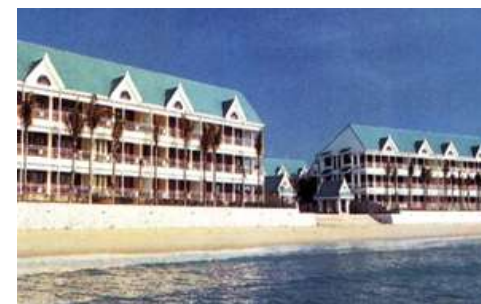
BAAN MON-CHALE - M,E,P -

M = Mechanical E = Electrical P = Plumbing