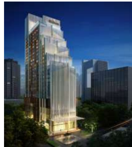
HILTON SUKHUMVIT BANGKOK M,E,P