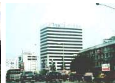
THAI LIFE INSURANCE