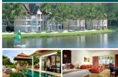
SHERATON GRAND LAGOON (Rebranded to ANGSANA)