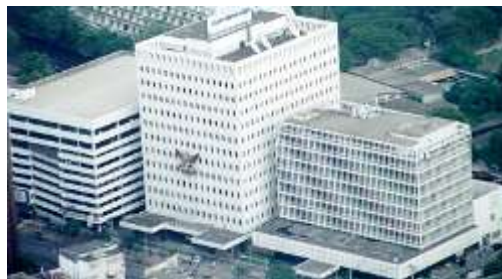
SIAM COMMERCIAL BANK (Old Head Quarter)