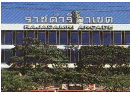
RAJADAMRI ARCADE - M.E -