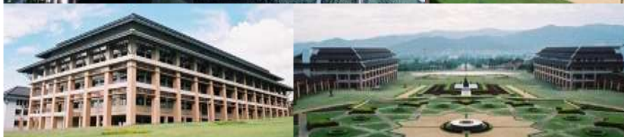
MAEFAH-LUANG UNIVERSITY Education Buildings - M.E.P -