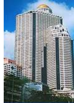
ROYAL CHAROENKRUNG - M,E -