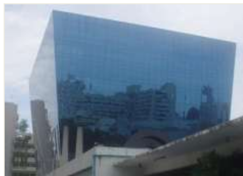
BLOOD CENTER THAI RED CROSS SOCIETY -M,E,P-