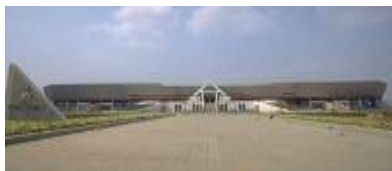
GYMNASIUM, 13 th ASIAN GAME - M -

STATE RAILWAY OF THAILAND The Master Plan for Land Use