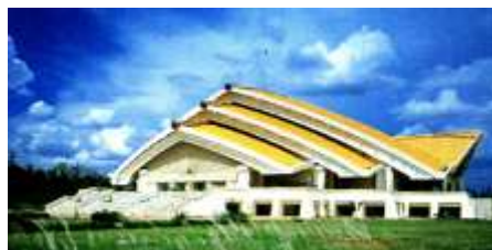
AUDITORIUM Khon Khaen University - M.E -