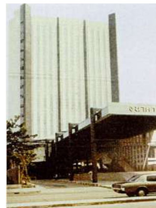
KRUNGTHAI BANK (Head Office) - M.E. -