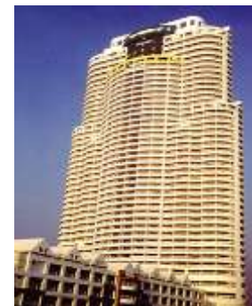
METRO JOMTIEN CONDOTEL - M,E,P -