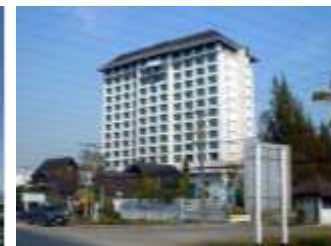
HOLIDAY INN CHIANG MAI - M.E.P. -