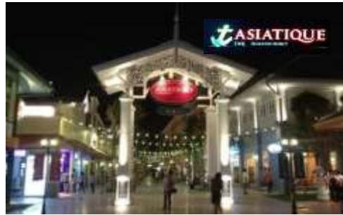
ASIATIQUE the river front -M,E,P-