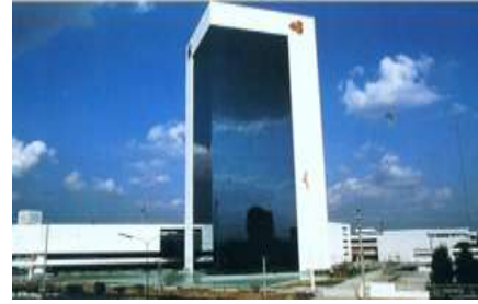
THAI AIRWAY INTERNATIONAL (Head Quarter) - M.E. -