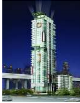
INTRO BY RASA Condominium - M.E.P -