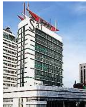
S31 HOTEL - M.E.P. -