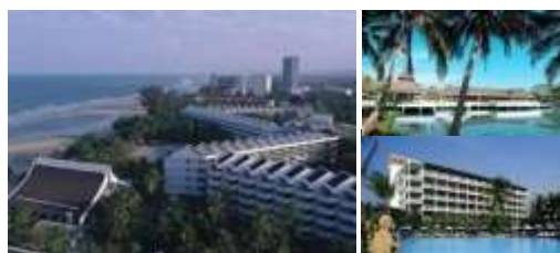
HOLIDAY INN REGENT BEACH CHA-AM (Renovation) - M.E.P. -