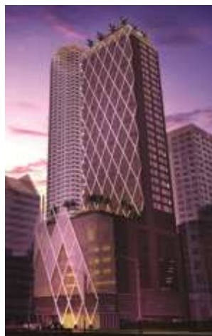
MODE SATHORN HOTEL M,E,P