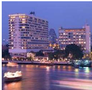
MANDARIN ORIENTAL The Renovation Back of House, Main Lobby