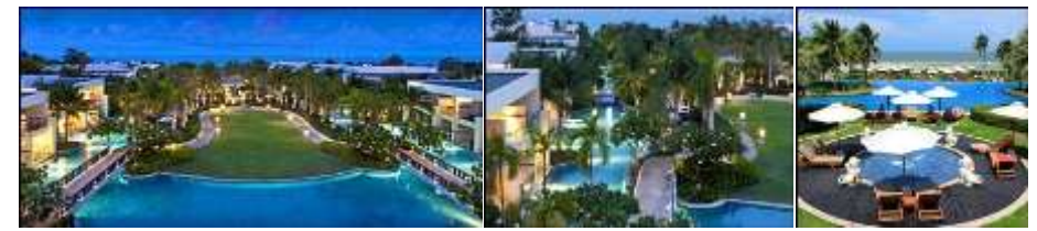
SHERATON GRANDE LAGOON HUA HIN - M.E.P. -