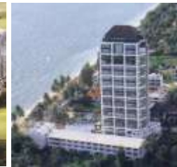
COCONUT BEACH CONDOMINIUM - M.E.P. -