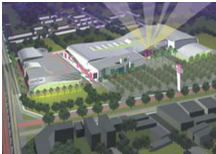
CENTRAL TOWN CENTER RATTANATHIBET -M,E,P-