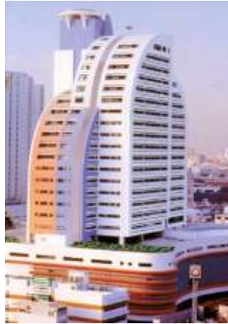
BANGRAK PLAZA -M-