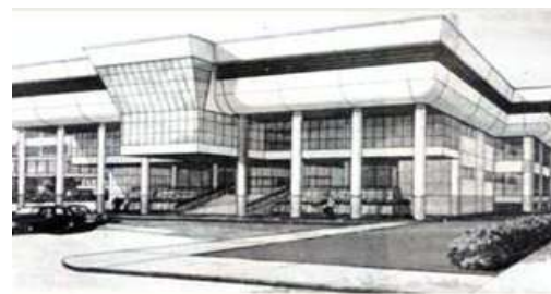
PARLIAMENT BUILDING (OFFICE) - M,E,P -

M = Mechanical E = Electrical P = Plumbing