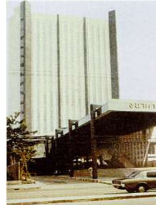
KRUNGTHAI BANK (Head Quarter) - M.E. -