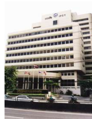
IFCT BUILDING - M.E. -

M = Mechanical E = Electrical P = Plumbing