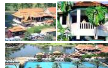
DUSIT AND RESORT HOTEL - M.E.P. -