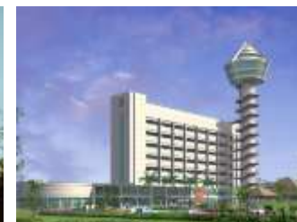
INDEPENDENCE HOTEL CAMBODIA - M.E.P. -