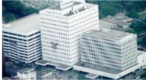
SIAM COMMERCIAL BANK (Old Head Quarter)