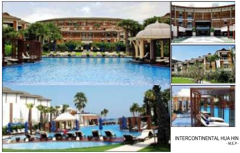
INTERCONTINENTAL HUA HIN - M.E.P. -