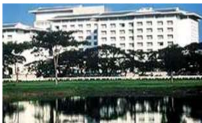
FOUR SEASONS HOTEL - M.E. -