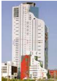
THE NATION TOWER I, II - M -