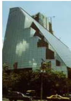
SIRIPINYO BUILDING - M,E -