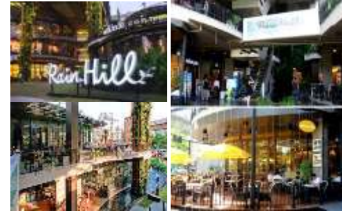
RAIN HILL -M,E,P-