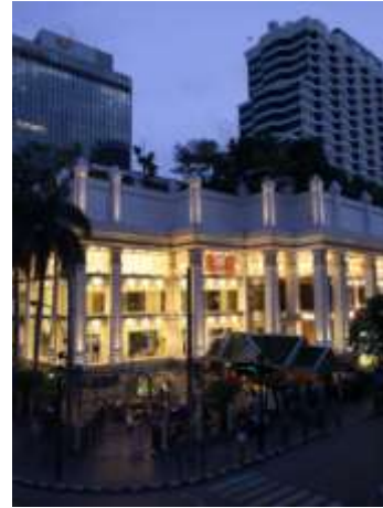
THE ERAWAN BANGKOK -M.E.P.-