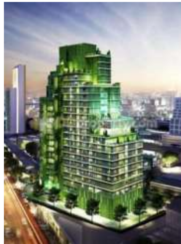
VERTIQ CONDOMINIUM -M,E,P-