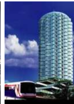
MERCURE AMBASSADOR HOTEL (Renovation) - M.E.P. -