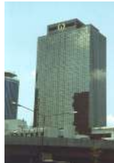
WALL STREET TOWER - M,E -