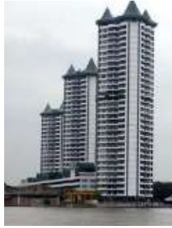
TRIDHOS CITY MARINA - M.E.P -