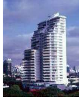
LA CASCADE - E -