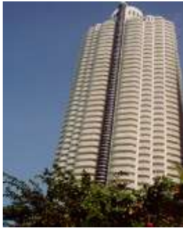
SKY BEACH CONDOMINIUM - E -