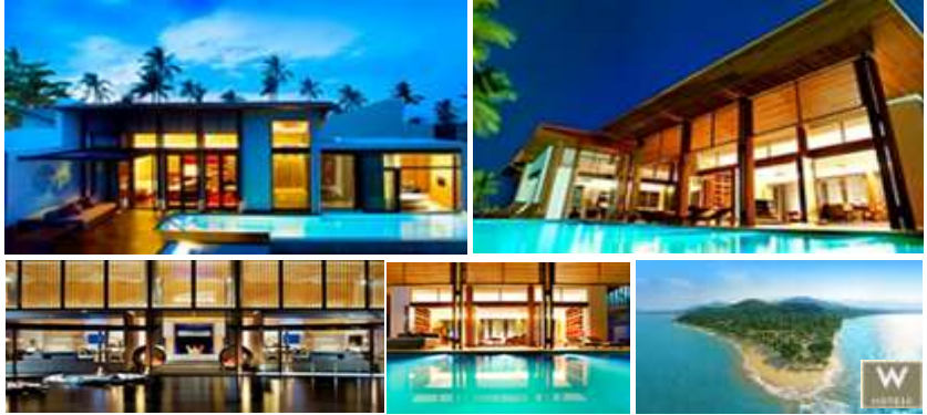
W. RETREAT, SAMUI - M.E.P. -