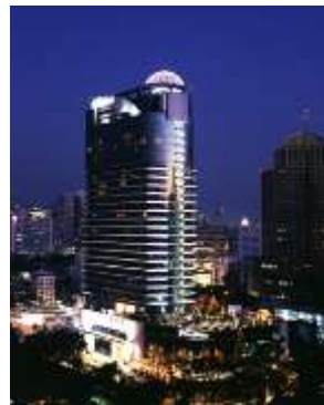
HOTEL PLAZA ATHENEES - M.E.P. -