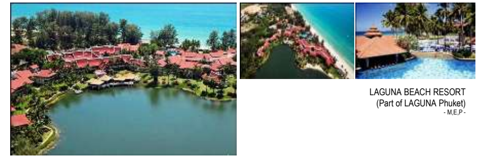
LAGUNA BEACH RESORT (Part of LAGUNA Phuket) - M.E.P. -

M = Mechanical E = Electrical P = Plumbing