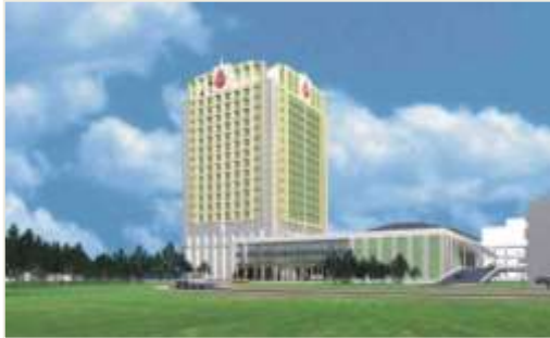
SRINAKARIN HOSPITAL -M,E,P-