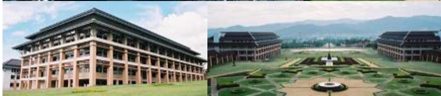
MAEFAH-LUANG UNIVERSITY Education Buildings - M.E.P -