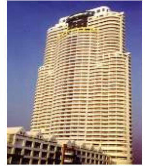
METRO JOMTIEN CONDOTEL - M.E.P -