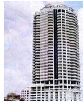
BANGKOK RIVER PARK - M.E.P -