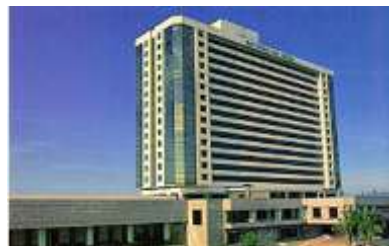
TWIN LOTUS HOTEL - M.E.P. -