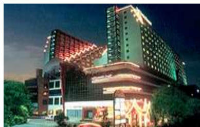
SOL TWIN TOWERS - M.E. -