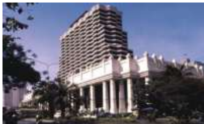
GRAND HYATT ERAWAN HOTEL - M.E. -