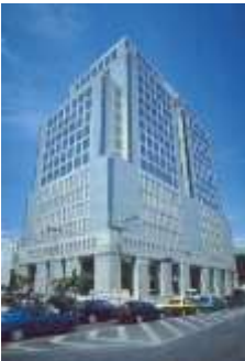
SRIJULSUP TOWER - M,E -