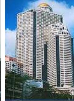
ROYAL CHAROENKRUNG - M.E. -