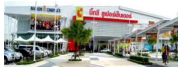
BIG C Super Center -M,E,P-