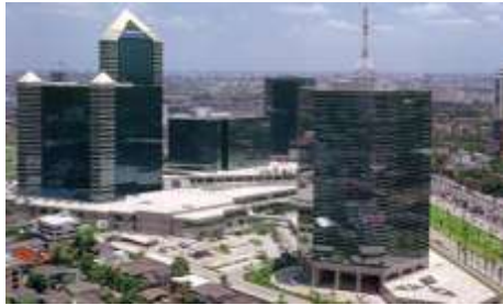
SIAM COMMERCIAL COMPLEX (PHASE III) - M.E.P. -