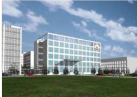
KHONKAEN HOSPITAL -M,E,P-