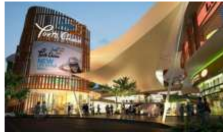
PORTO CHINO -M,E,P-