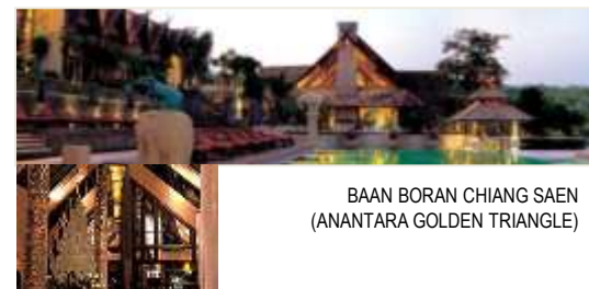
BAAN BORAN CHIANG SAEN (ANANTARA GOLDEN TRIANGLE)

M = Mechanical E = Electrical P = Plumbing