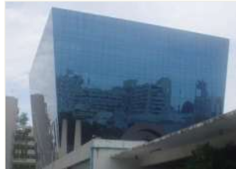
BLOOD CENTER THAI RED CROSS SOCIETY -M,E,P-