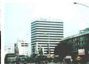
THAI LIFE INSURANCE