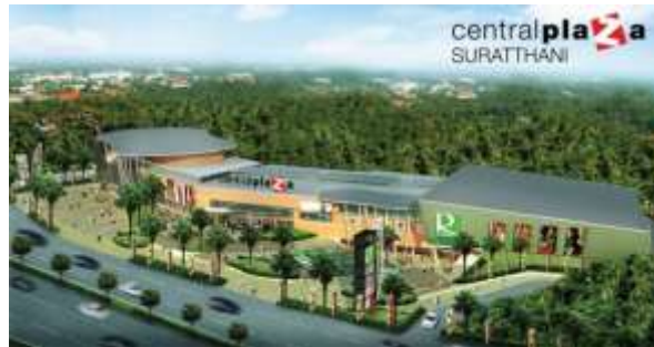
CENTRAL PLAZA SURATTHANI -M,E,P-