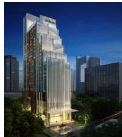
HILTON SUKHUMVIT BANGKOK M,E,P