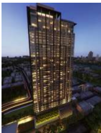
URBANO SATHORN -M,E,P-