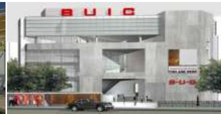
BANGKOK UNIVERSITY ART GALLERY - M.E.P -