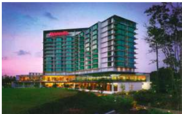
MARIOTT RAYONG M,E,P

M = Mechanical E = Electrical P = Plumbing