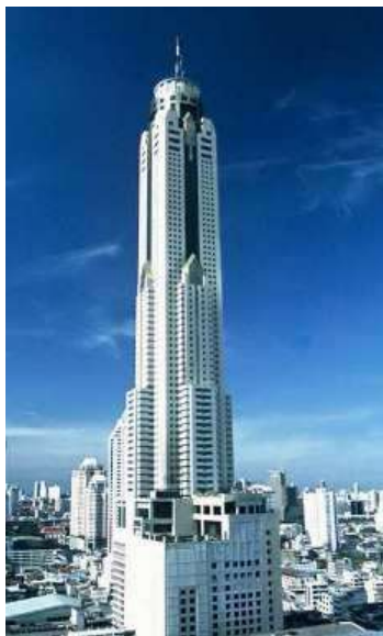
BAIYOKE SKY HOTEL Currently the tallest building in Thailand - M.E.P. -