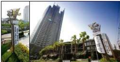
THE VUE -M,E,P-