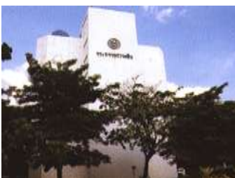
MINISTRY OF FINANCE - E -