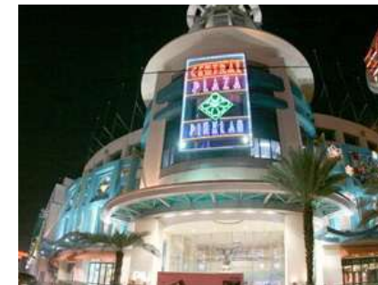
CENTRAL PLAZA PINKLAO (The Renovation) -M,E,P-

M = Mechanical E = Electrical P = Plumbing