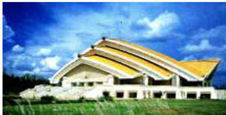
AUDITORIUM Khon Khaen University - M.E -