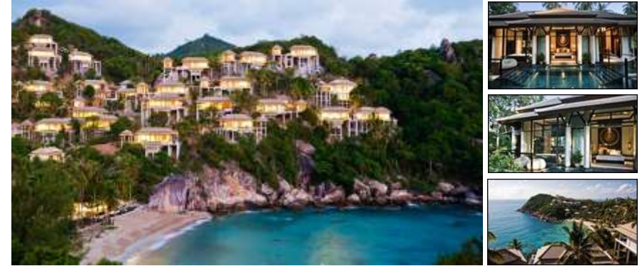
BANYAN TREE, SAMUI - M.E.P. -