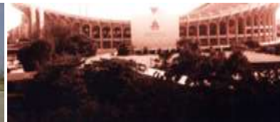
HUAMARK STADIUM - E -

M = Mechanical E = Electrical P = Plumbing