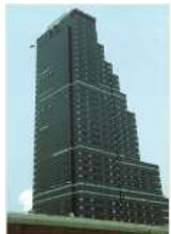
GEMS TOWER - M,E,P -

M = Mechanical E = Electrical P = Plumbing