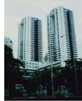
SATHORN GARDEN - M -