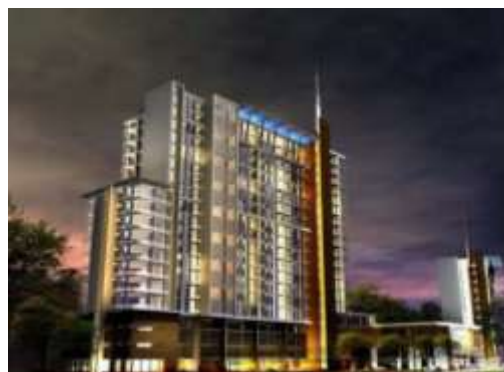
THE AXIS CONDOMINIUM -M,E,P-