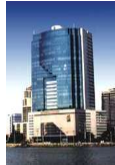
C.T.I TOWER - M,E -