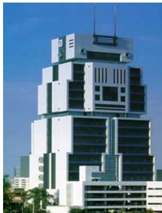
BANK OF ASIA (Head Quarter) - M -