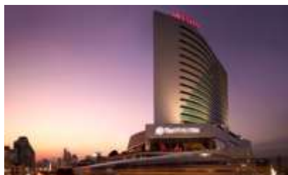
WESTIN GRANDE SUKHUMVIT - M. -