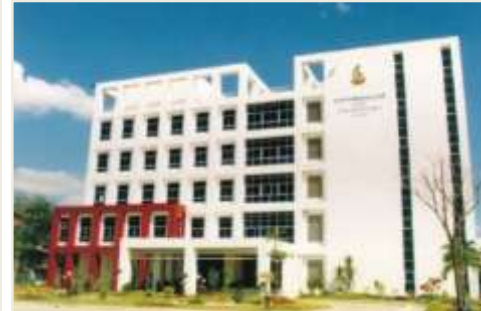
BUA YAI HOSPITAL -M,E,P-