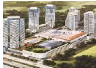
CENTRAL BANGNA (East Tower) - M.E.P. -