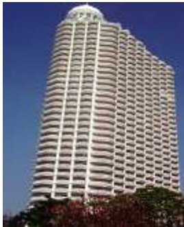
PARK BEACH CONDOMINIUM - E -