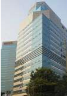
MALEENOND TOWER (Channel 3 TV Studio) - M,E,P -