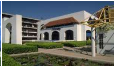
THAMMASAT UNIVERSITY LIBRARY - M -