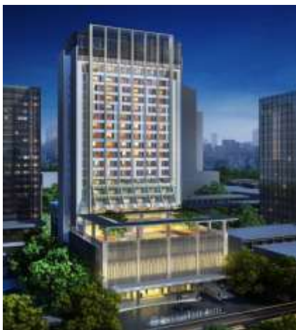
DOUBLE TREE by HILTON M,E,P