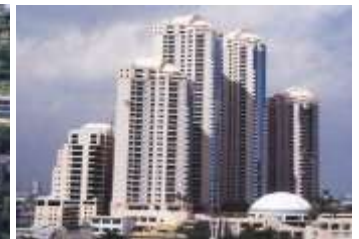
THE PRESIDENT PARK - M.E. -

M = Mechanical E = Electrical P = Plumbing