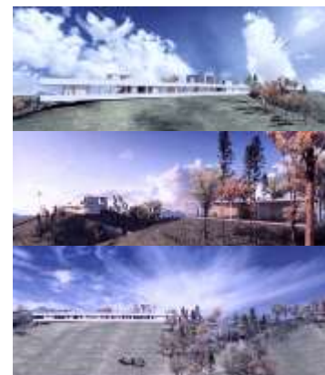
KHAO-YAI RESIDENCE -M,E,P-

M = Mechanical E = Electrical P = Plumbing