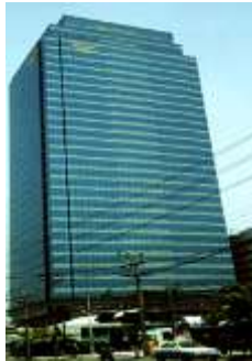
GRAND AMARIN TOWER - M,E,P -