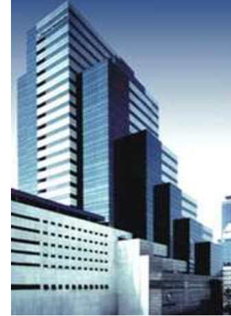
SILOM COMPLEX -E.P.-