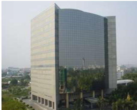
SAMAGGI TOWER - M.E.P. -