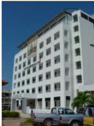
KALASIN HOSPITAL -M,E,P-