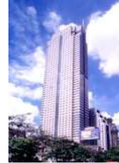
JEWELRY TRADE CENTER - M,E,P -