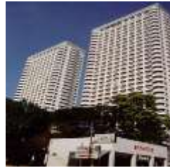
JOMTIEN COMPLEX - E -