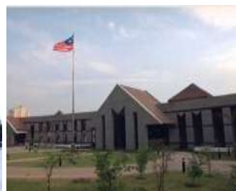
MALAYSIAN EMBASSY - M -