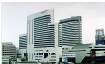
J.W. MARRIOTT HOTEL (Ploenchit Center) - M. -