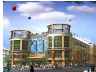
GOLDEN CITY SHOPPING CENTER PHNOM PENH