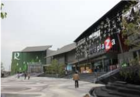
CENTRAL PLAZA CHIANG-RAI -M,E,P-