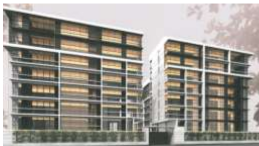
MODE SUKHUMVIT 61 -M,E,P-