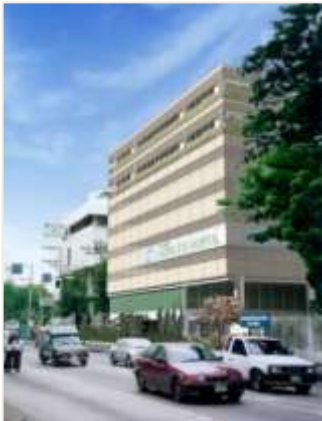
RATNIN EYE HOSPITAL -M,E,P-