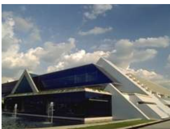
MINISTRY OF FOREIGN AFFAIR - M -