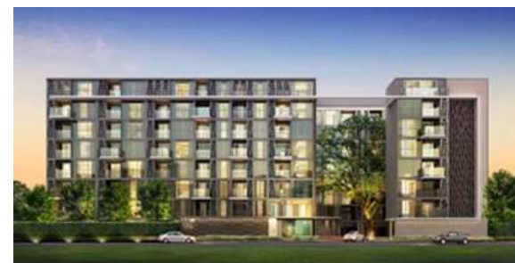
VIA BOTANI -M,E,P-