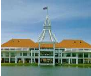
THAMMASAT UNIVERSITY (Rangsit Campus) - Main Admission Office Building - Lecture Building I - Lecture Building III - Lecture Building IV - Faculty of Engineering Building (Int.) - Library Building (Bangkok campus) - Laboratories - Multi-Purpose Building (Bangkok campus)