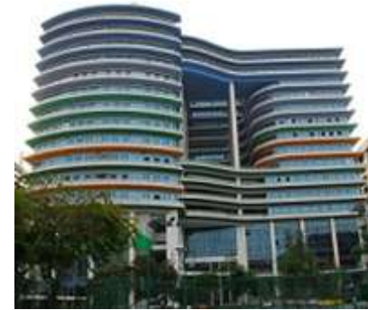
SIRIRAJ HOSPITAL Laboratory and IT studies for medical student -M,E,P-

M = Mechanical E = Electrical P = Plumbing