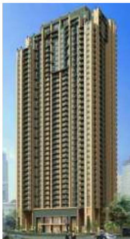
VILLA ASOKE -M,E,P-