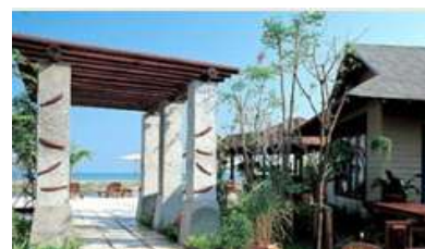
FISHERMAN'S VILLAGE - E. -