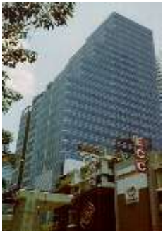
S.S.P TOWER III - M,E,P -