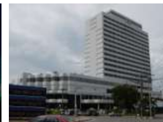
METROPOLE HOTEL, PHUKET - M.E.P. -

M = Mechanical E = Electrical P = Plumbing