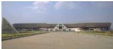
GYMNESIUM, 13 th ASIAN GAME - M -