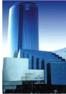
UNITED CENTER - M,E -