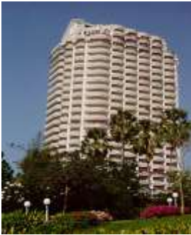
SILVER BEACH CONDOMINIUM - E -