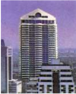
SATHORN PARK PLACE - M.E.P -