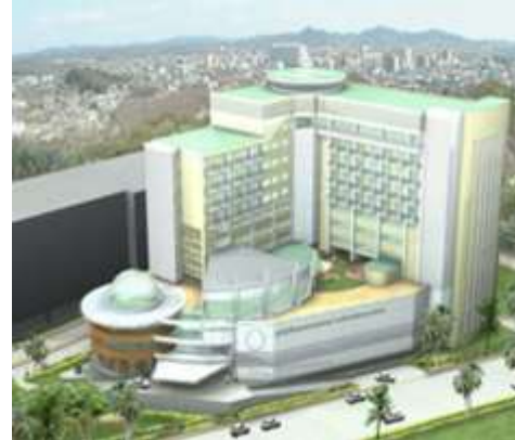
SONGLANAKARIN HOSPITAL -M,E,P-

M = Mechanical E = Electrical P = Plumbing