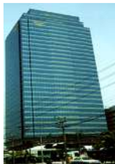
GRAND AMARIN TOWER - M,E,P -