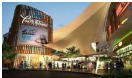
PORTO CHINO - M.E.P. -