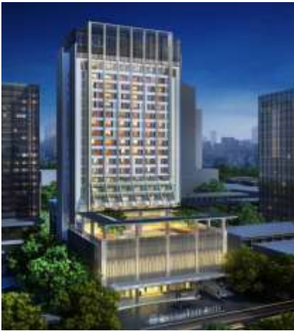
DOUBLE TREE by HILTON M,E,P