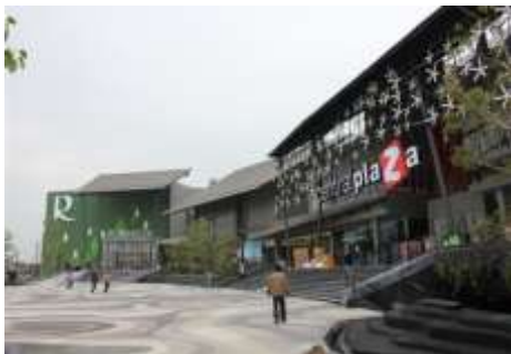
CENTRAL PLAZA CHIANG-RAI - M.E.P. -