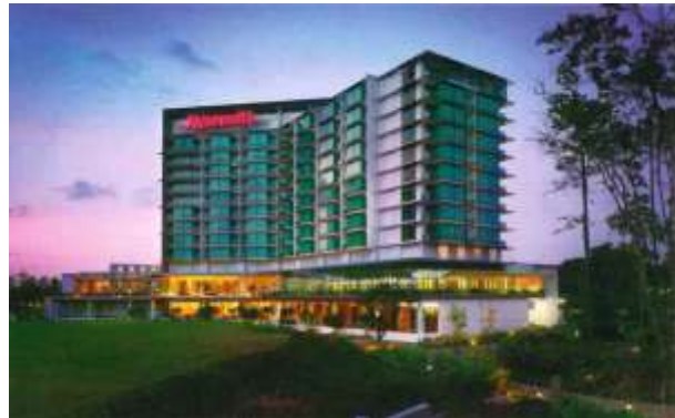
MARIOTT RAYONG M,E,P

M = Mechanical E = Electrical P = Plumbing