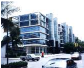
VILLA OFFICE - M, E, P -