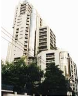
CITY LAKE CONDOMINIUM - M.E. -