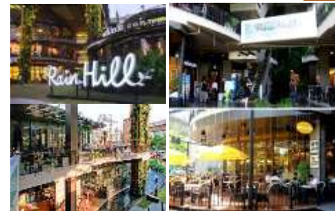
RAIN HILL - M.E.P. -