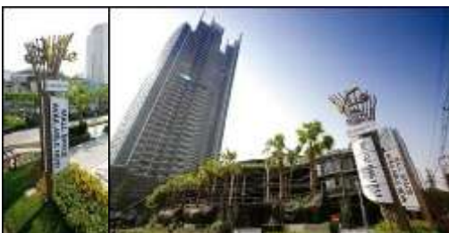
THE VUE - M.E.P. -