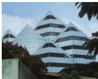
BEAUTY GEMS BUILDING - M, E -