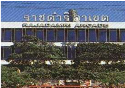
RAJADAMRI ARCADE -M,E-