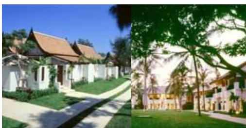
SALA-SAMUI RESORTS - M.E.P. -