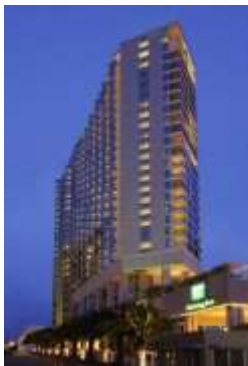
HOLIDAY INN PATTAYA - M.E.P. -