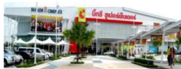
BIG C Super Center - M.E.P. -