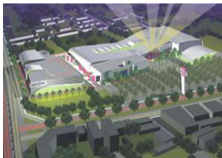
CENTRAL TOWN CENTER RATTANATHIBET - M.E.P. -