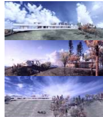
KHAO-YAI RESIDENCE -M,E,P-

M = Mechanical E = Electrical P = Plumbing