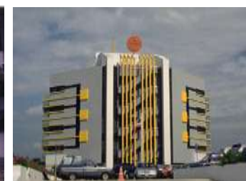
METROPOLITAN ELECTRICITY AUTHORITY, BANGKOK - M -