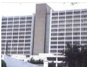
UNITED NATIONS - ESCAP - M, E -