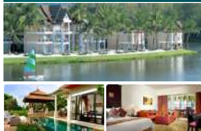
SHERATON GRAND LAGOON (Rebranded to ANGSANA)