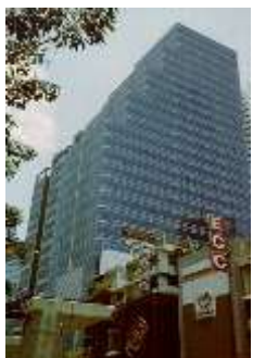
S.S.P TOWER III - M,E,P -