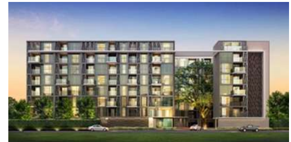
VIA BOTANI -M,E,P-