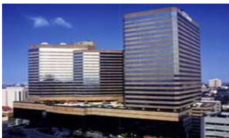
LECONCORDE COMPLEX - M, E, P -