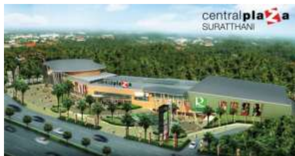
CENTRAL PLAZA SURATTHANI - M.E.P. -