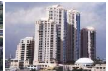
THE PRESIDENT PARK - M.E. -

M = Mechanical E = Electrical P = Plumbing