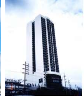
LUMPINI PARK VIEW - M.E.P. -