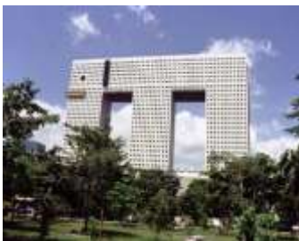
ELEPHANT BUILDING - M, E, P -