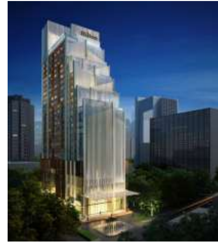
HILTON SUKHUMVIT BANGKOK M,E,P