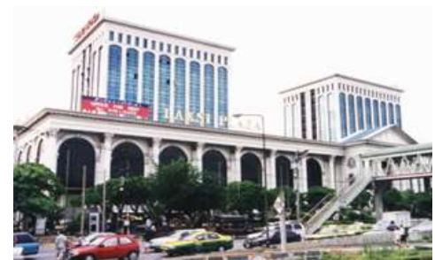
LAKSI PLAZA -M,E-

M = Mechanical E = Electrical P = Plumbing