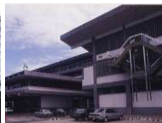
BANK NOTE PRINTING - M, E -