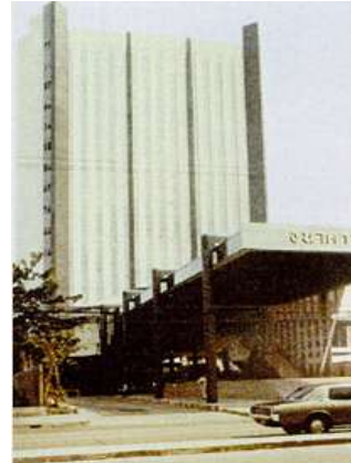
KRUNGTHAI BANK (Head Quarter) - M.E. -