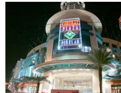
CENTRAL PLAZA PINKLAO (The Renovation) - M.E.P. -

M = Mechanical E = Electrical P = Plumbing