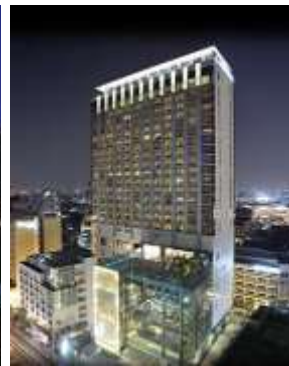
LE MERIDIEN BANGKOK - M.E.P. -