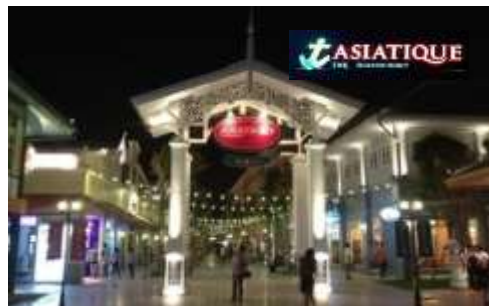
ASIATIQUE the river front - M.E.P. -