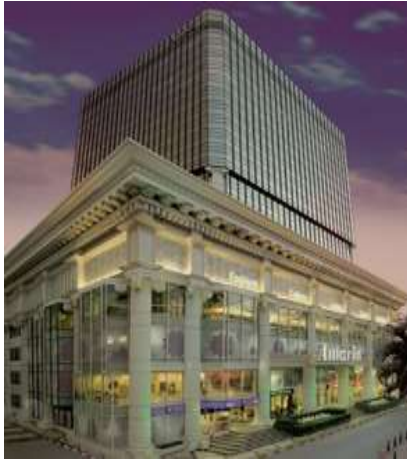
AMARIN PLAZA -M,E-